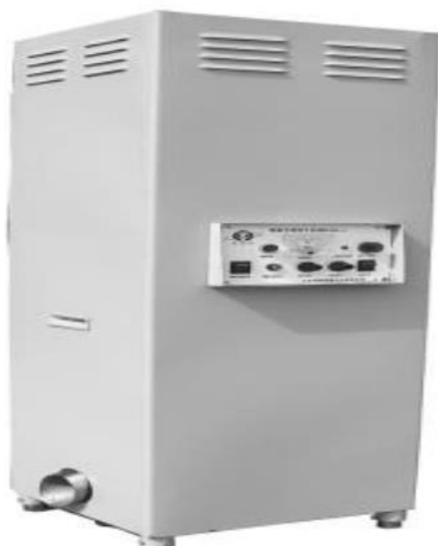
Figure1. Schematic diagram of the DL-2 plasma seed processing device