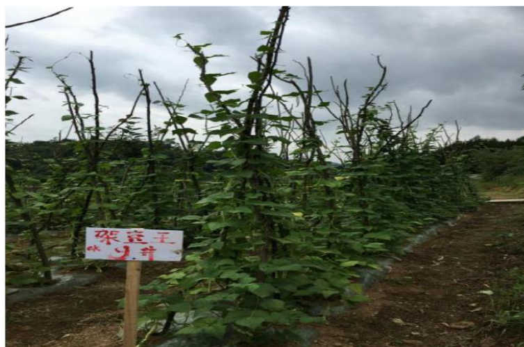
Figure3. (Color online) The growth of green beans untreated group CK (control) in field under the same external environment