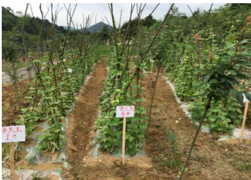
Figure2. (Color online) The growth of green beans treated with different doses of plasma in field

yield 9 kg~13kg (plasma dose 1000mA), treatment group No. 7 pod yield 8 kg-13kg (plasma dose 1400mA), corresponding to single pod yield 28.57%~30%, 14.28%~30% higher than CK, respectively. Lowest single pod yield also increased by 14.28% (plasma dose 200mA). From the start-up period, the start-up period of all 8 groups treated by plasma was 2~6 days more than that of untreated CK. To sum up, plasma treatment with different doses (plasma current 200mA~1600mA) can promote the growth, development and yield of green bean, in which the treatment yield effect of appropriate dose (1000mA) is extremely significant, and the plasma current treatment 600mA, 800mA, 1400mA has a significant effect on green bean yield.