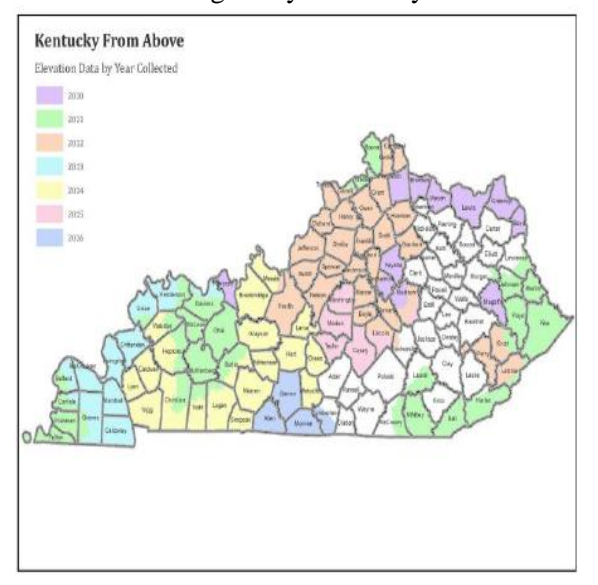
Figure.1 LIDAR coverage of Kentucky

provides statewide LIDAR coordination with local, Commonwealth, and national groups in support of 3DEP for the Commonwealth, (Carswell 2014). The state of Kentucky has been documented with the exception of the Appalachian region, (Figure 1). The Appalachian region of eastern Kentucky is covered by the Daniel Boone National Forest. Foliage from the trees provides interference between the beams and the ground. GIS specialists hope that all of Kentucky will have LIDAR coverage by January of 2019.